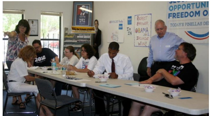
Some of those attending the OFA meeting