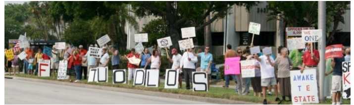
Some of the activists and signs in front of Brandes offices

Tallahassee wrapping up from the just-ended legislative session.