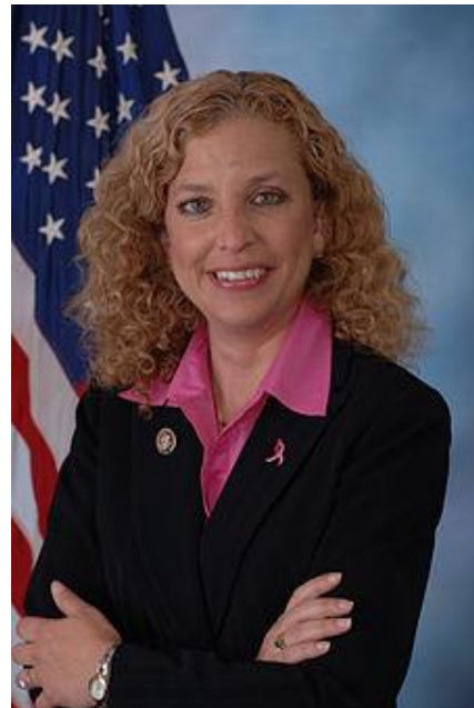
Debbie Wasserman Schultz 52nd Chair of the Democratic National Committee

Nominated by President Obama to replace Tim Kaine, who has stepped down to run for the U.S. Senate in Virginia, Wasserman Schultz brings to the DNC a formidable package: she comes from Florida, a 2012 battleground state; boasts an impressive fund-raising track record; and has a unique perspective as a working mother and a cancer survivor that connects her to female voters.