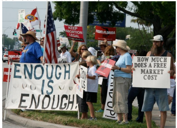
Protestors included union members, teachers, pro-choice activists and Democratic Party activists.